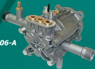
LB3WZ - 1206-A