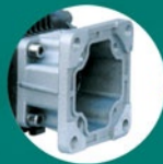
LB3WZ - A