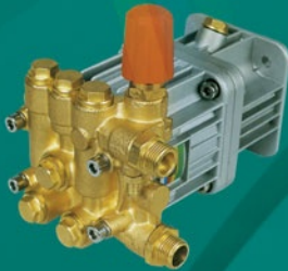
LB3WZ - 2525-A