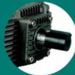
LB3WZ - B