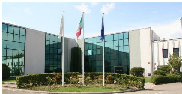
DAB BIENTINA – (PISA, ITALY)