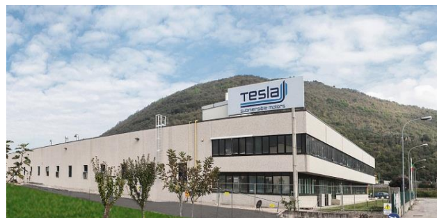
DAB SAN GERMANO – (VICENZA, ITALY)