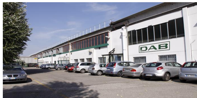
DAB BRENDOLA – (VICENZA, ITALY)