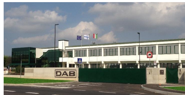
DAB MESTRINO (PADUA, ITALY) - Headquarter