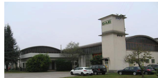
DAB CASTELLO DI GODEGO – (TREVISO, ITALY)