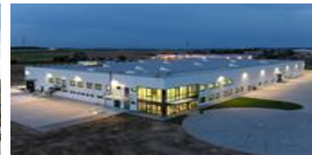
DAB HUNGARY - Nagykanizsa